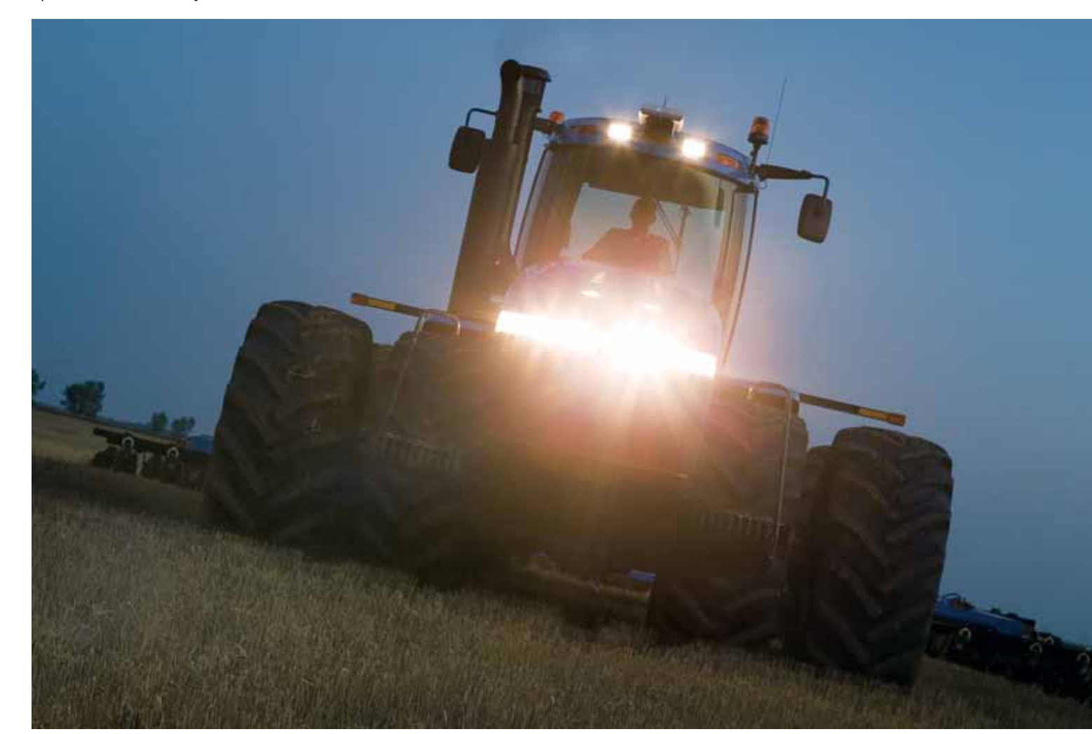
Halogen work lights, plus High-Intensity Discharge (HID) lamps, brighten the night. You can adjust eight of the work lights to focus more illumination on areas in front of, behind and to the side of the tractor.

Comfortably seated, and without stretching, you can reach overhead controls for heat, air conditioning, lights and the premium audio system. Armrest controls are ergonomically designed and positioned. On T9000 models with the powershift transmission the armrest controls adjust fore/aft, up and down. On the armrest you'll find controls for AutoShift™, hydraulic remotes, flow settings, diff lock, hitch, custom headland management, slip limit and the throttle.